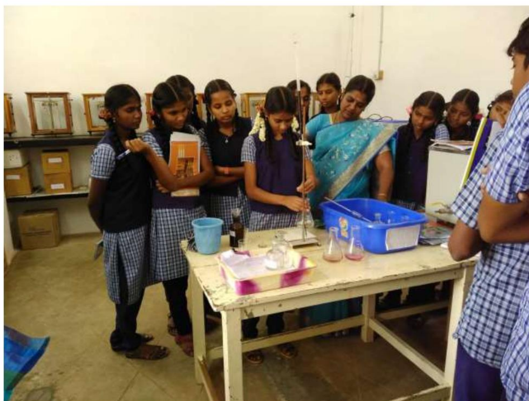
Outreach Program Government Higher Secondary School, Thalaisyuthu, Palani. 7.12.2018